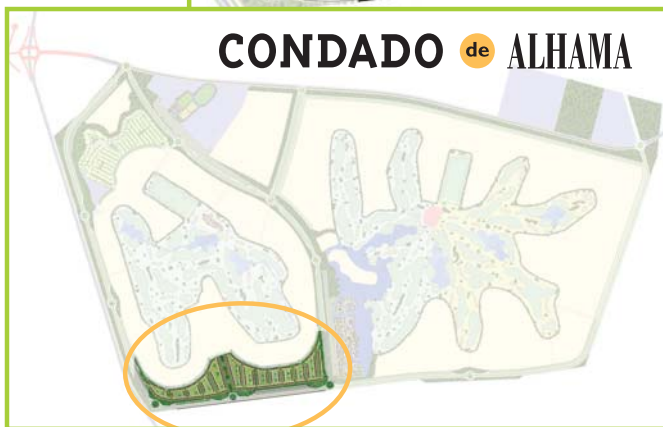
CONDADO de ALHAMA

2 bedroom apartments from £ 82,000 * 3 bedroom apartments from £ 89,800 *