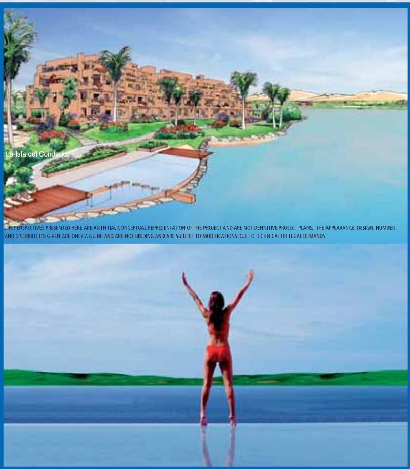
La Isla del Condado

Imagine getting up at first light to take in the wonder of nature whilst having breakfast. Imagine the freshness of the lake, the vitality of the golf course... Sensations of wellbeing and tranquillity which are hard to beat. La Isla del Condado Golf Resort is a true paradise.